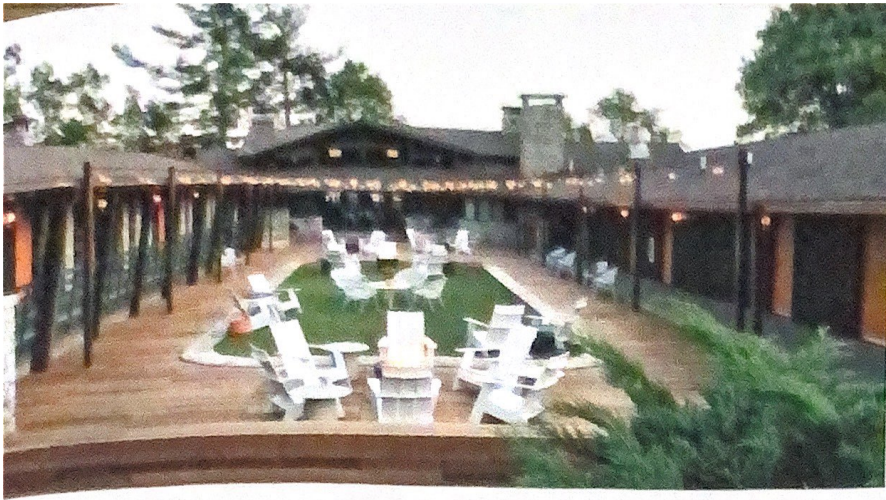
The courtyard lawn at the Skyline Lodge, in Highlands, North Carolina.

of exterior-entry rooms arranged around a communal gathering space; extensive renovations have replaced the courtyard swimming pool with a lawn outfitted with lounge seating, firepits, and games.